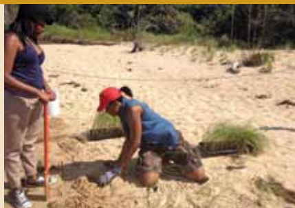
High school students dig holes in the sand for planting in an effort to aid in the restoration of the sand dunes.

“The best part of my summer work experience was staying on the NSU campus. It allowed us to be