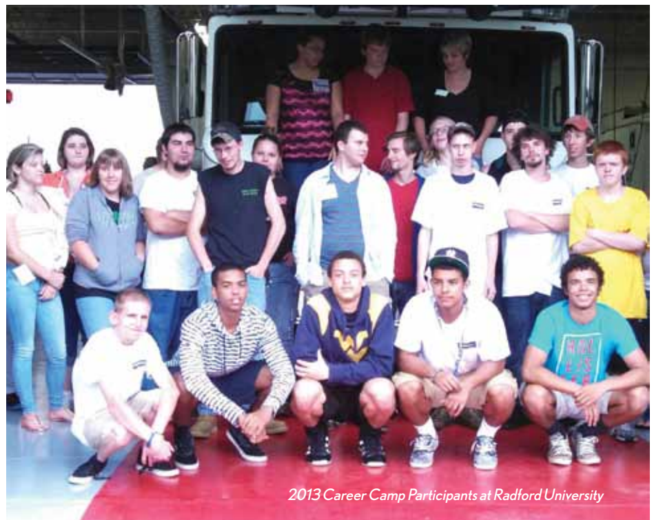
2013 Career Camp Participants at Radford University

Goodwill Industries of the Valleys was excited about this collaboration with Radford University and plans to conduct a second Career Camp in June 2014. At the concluding celebration and recognition ceremony for this year's camp, a participant summed up the experience nicely when he said, "I never knew science and technology could be put to use in so many cool ways!"