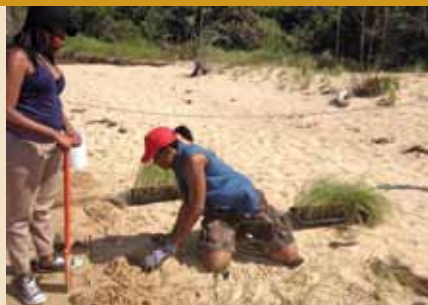
High school students dig holes in the sand for planting in an effort to aid in the restoration of the sand dunes.

“The best part of my summer work experience was staying on the NSU campus. It allowed us to be