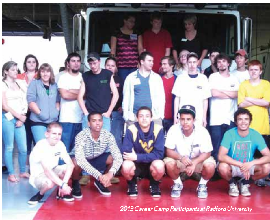
2013 Career Camp Participants at Radford University

Goodwill Industries of the Valleys was excited about this collaboration with Radford University and plans to conduct a second Career Camp in June 2014. At the concluding celebration and recognition ceremony for this year's camp, a participant summed up the experience nicely when he said, "I never knew science and technology could be put to use in so many cool ways!"